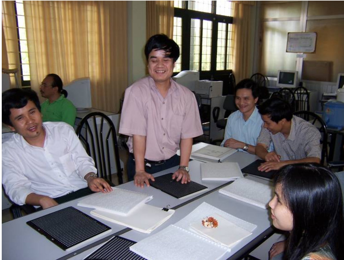
The students discussed each other's presentations