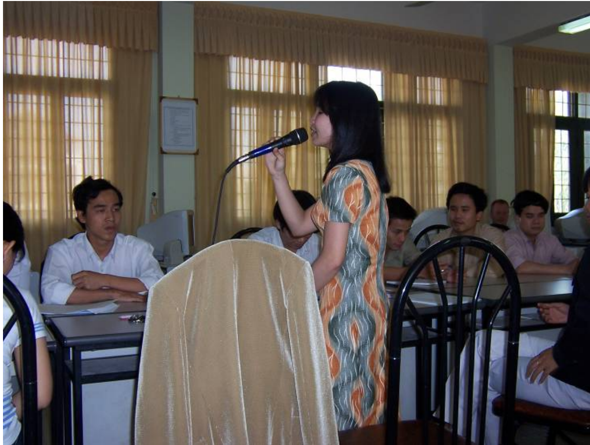
Friday afternoon – cultural exchange