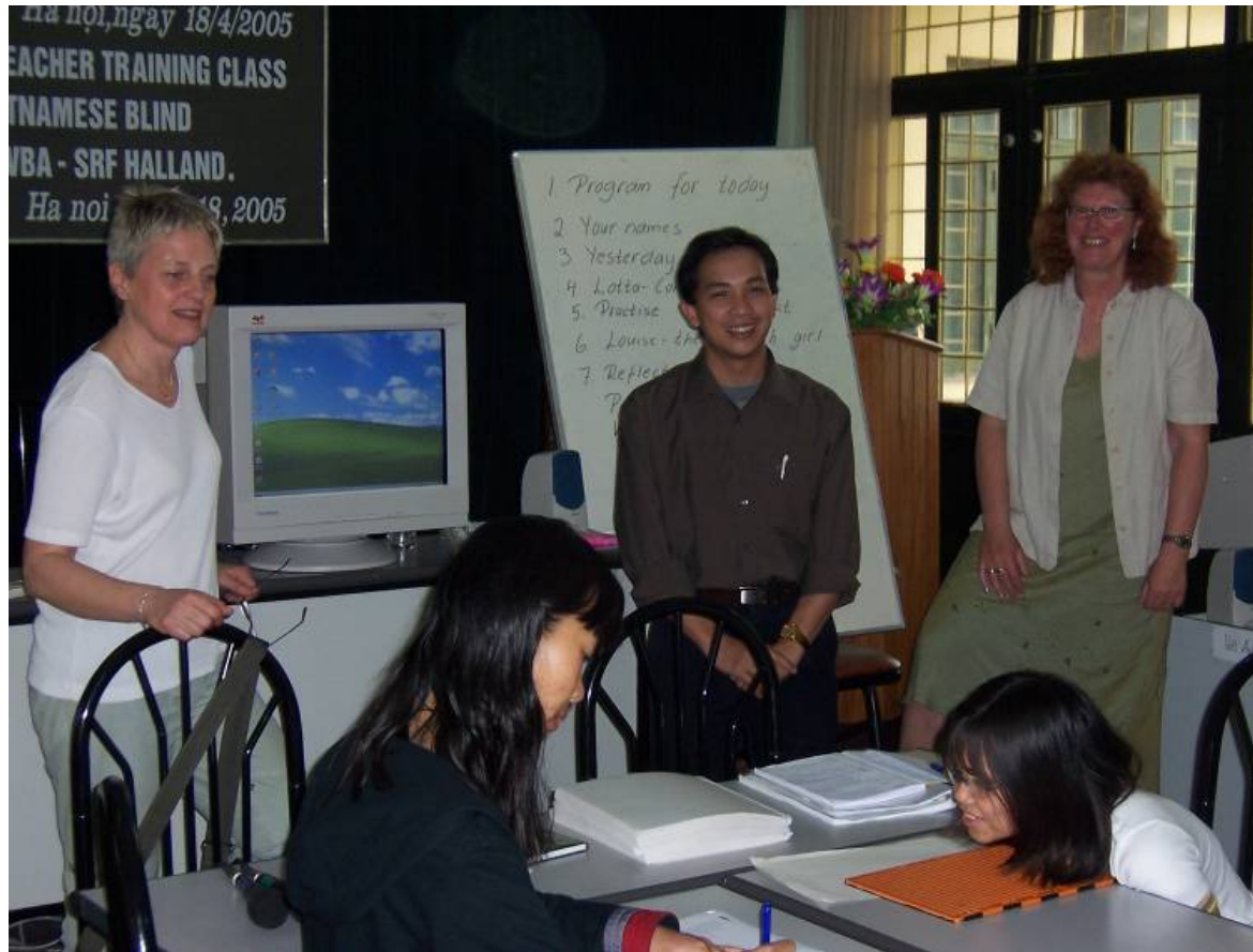
Translation from English to Vietnamese