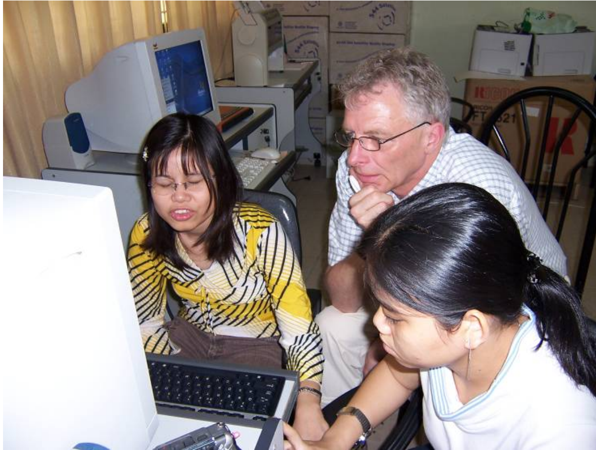
Five of the students learned to be “technicians”