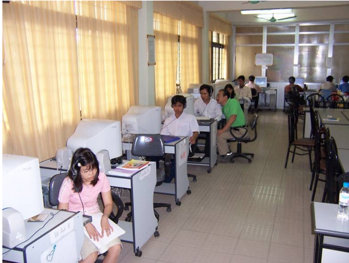
Teaching each other