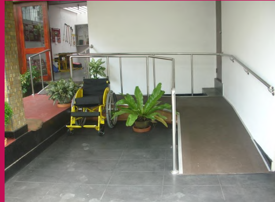
LC DISABILITY RESOURCE CENTRE ASSISTIVE DEVICES