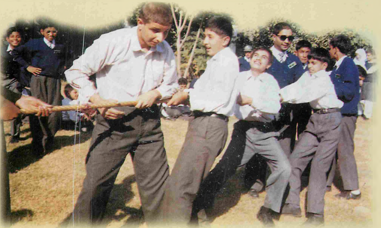
Healthy Sports activities