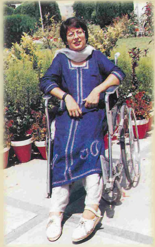
Use of wheel chair