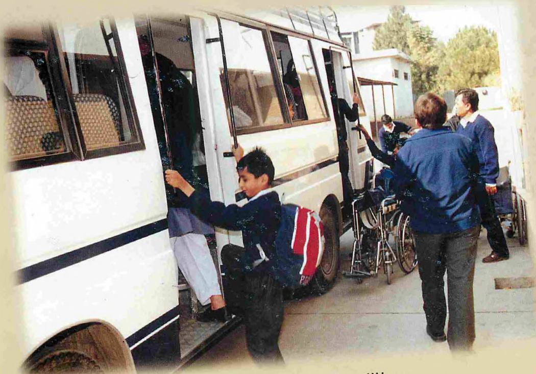
Pick and drop facility