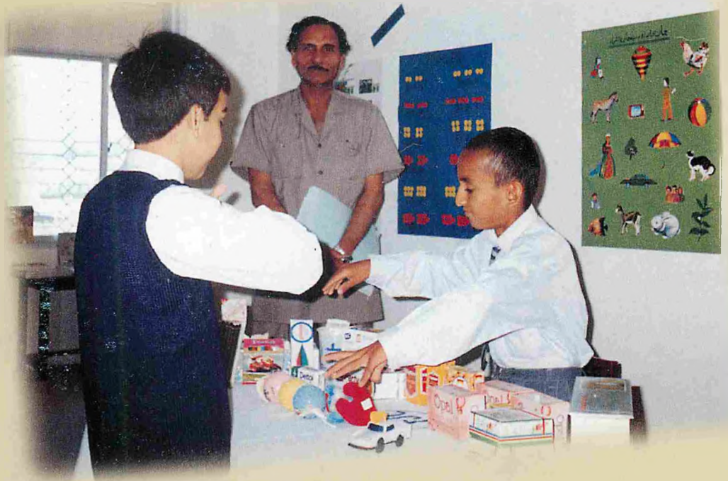
Art and craft skills