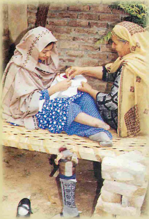
Art and craft skills