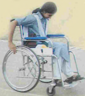
Healthy Sports activities