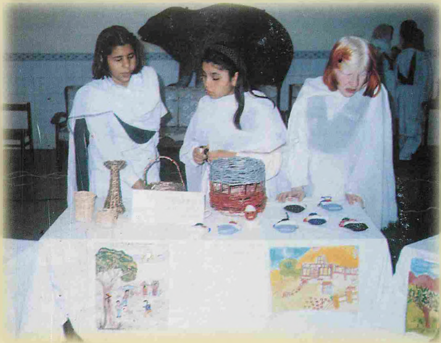
Art and craft skills